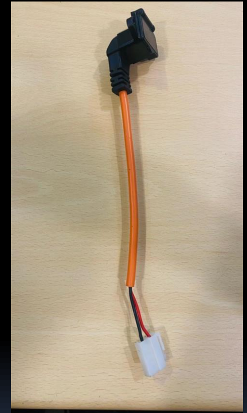
AC Socket Battery Charger